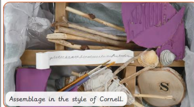
Assemblage in the style of Cornell.

Cornell made 3D art from found objects with personal meaning assembled in a box. He was one of the first artists to create 'Assemblage' art.