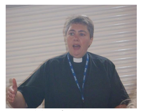
Q7: How did you feel when you were called by God?

A:I only go into two schools Corpus Christi and Rainford.